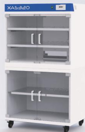
2 Subframe with castors

Elevates the cabinet for a easier loading. Swivel castors with brakes. Shelf surcharge.